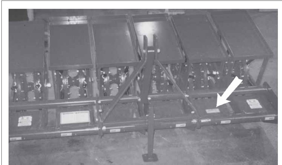
3 Point Hitch

The serial number plate is located where indicated. Please mark the number in the space provided for easy reference.