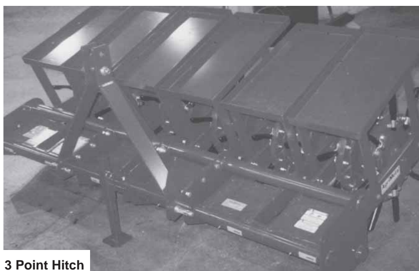
3 Point Hitch